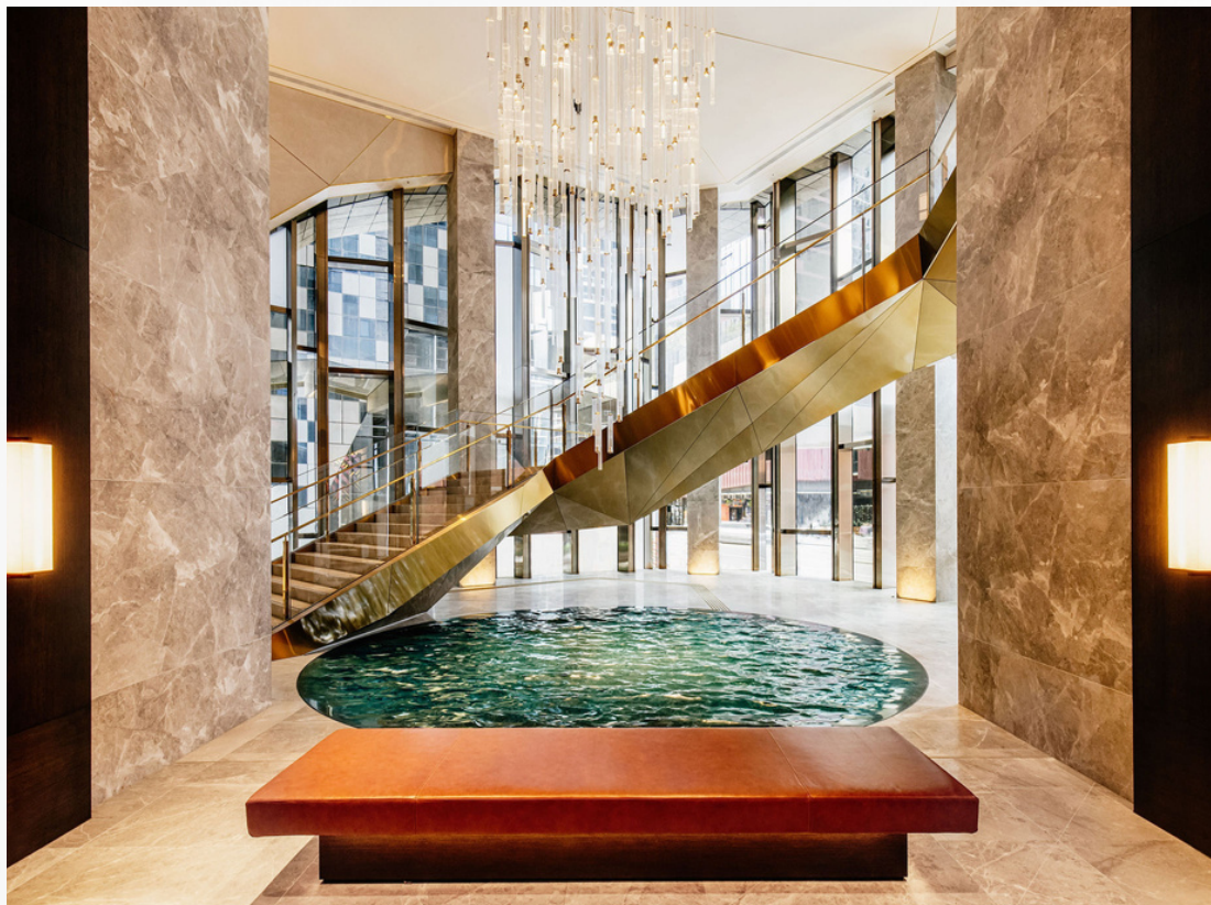
> RITZ CARLTON, MELBOURNE - Completed and opened the Ritz-Carlton Hotel, Melbourne