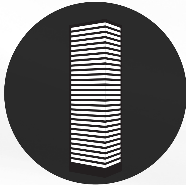
640 Bourke Street Melbourne Launch (700 apartments)