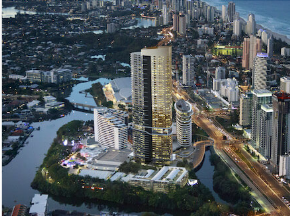
> STAR RESIDENCES, GOLD COAST - Commenced and completed 100% of settlements for Tower 1