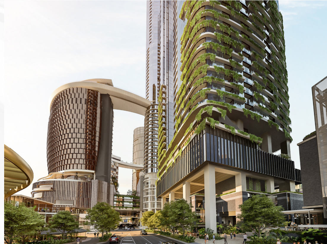
> QUEEN'S WHARF TOWER, BRISBANE - Launched QWT and sold 90% within the first 4 weeks