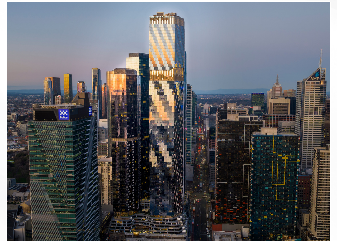
> WEST SIDE PLACE, MELBOURNE - Completed and settled West Side Place Stage 2