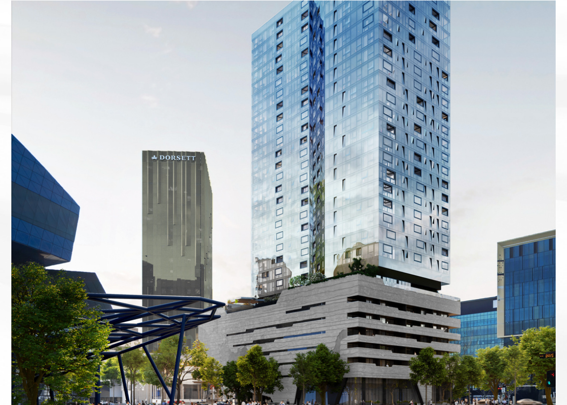
> PERTH HUB - We launched FEC Constructions, who topped out Perth Hub