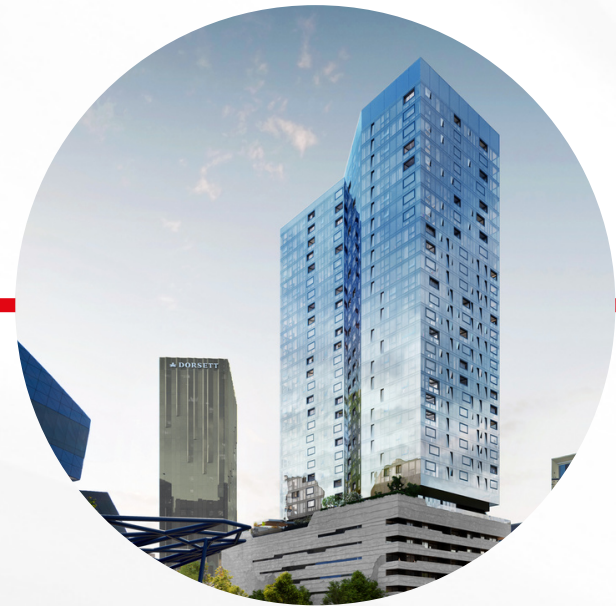
Perth Hub Settlements Commence