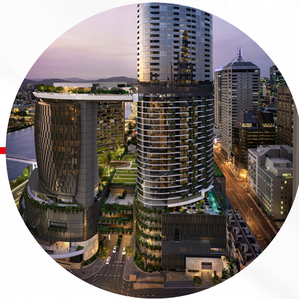
Queen's Wharf Tower 4 Settlements Commence