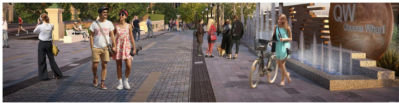
The Queen's Wharf development is creating 8000 jobs.

Deputy Premier and Minister State Development Steven Miles said the state is in the box seat to seize the momentum.