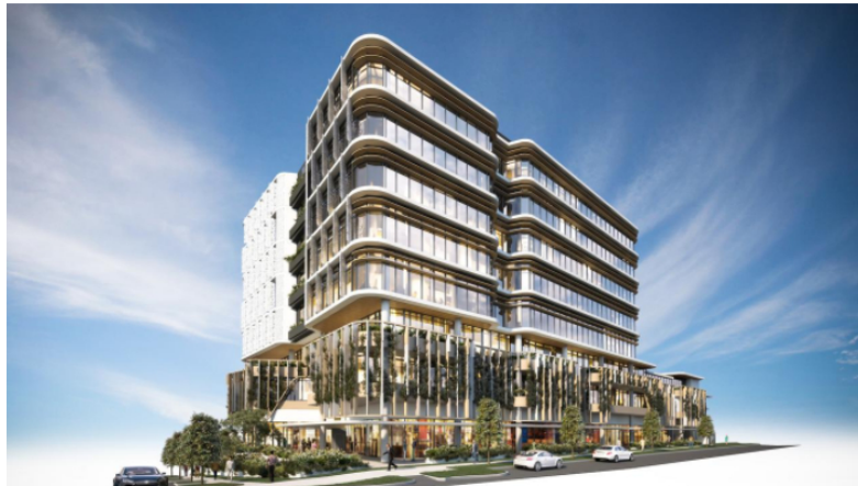
An artist's impression of Proxima, a state government project planned for the Gold Coast Health and Knowledge Precinct at Southport

“But if the planning doesn’t keep pace, the infrastructure and investment doesn’t keep pace with the population increase, then you end up overshooting the amenity so that Liveability people went there for ends up diminishing.”