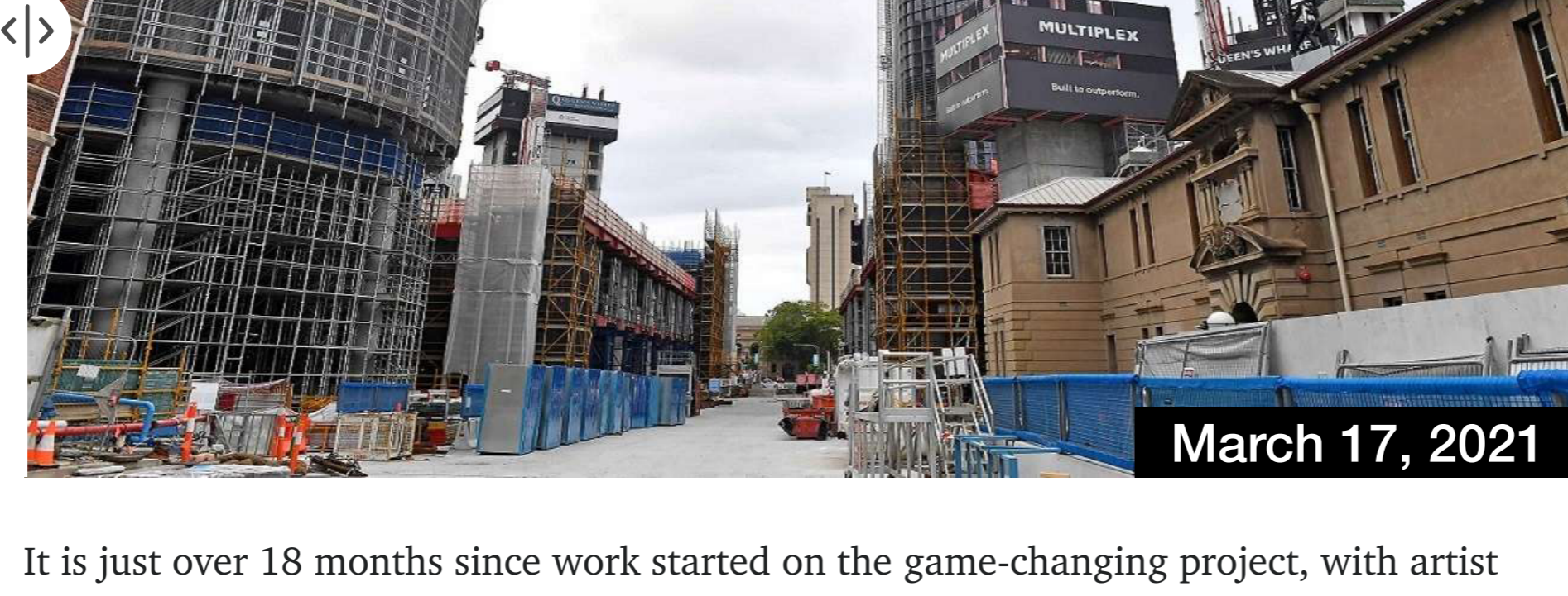
March 17, 2021

While most of the structures under construction stand only a few levels above the CBD streets, the sheer size of the project means the work already completed is the equivalent of two 60-storey buildings.