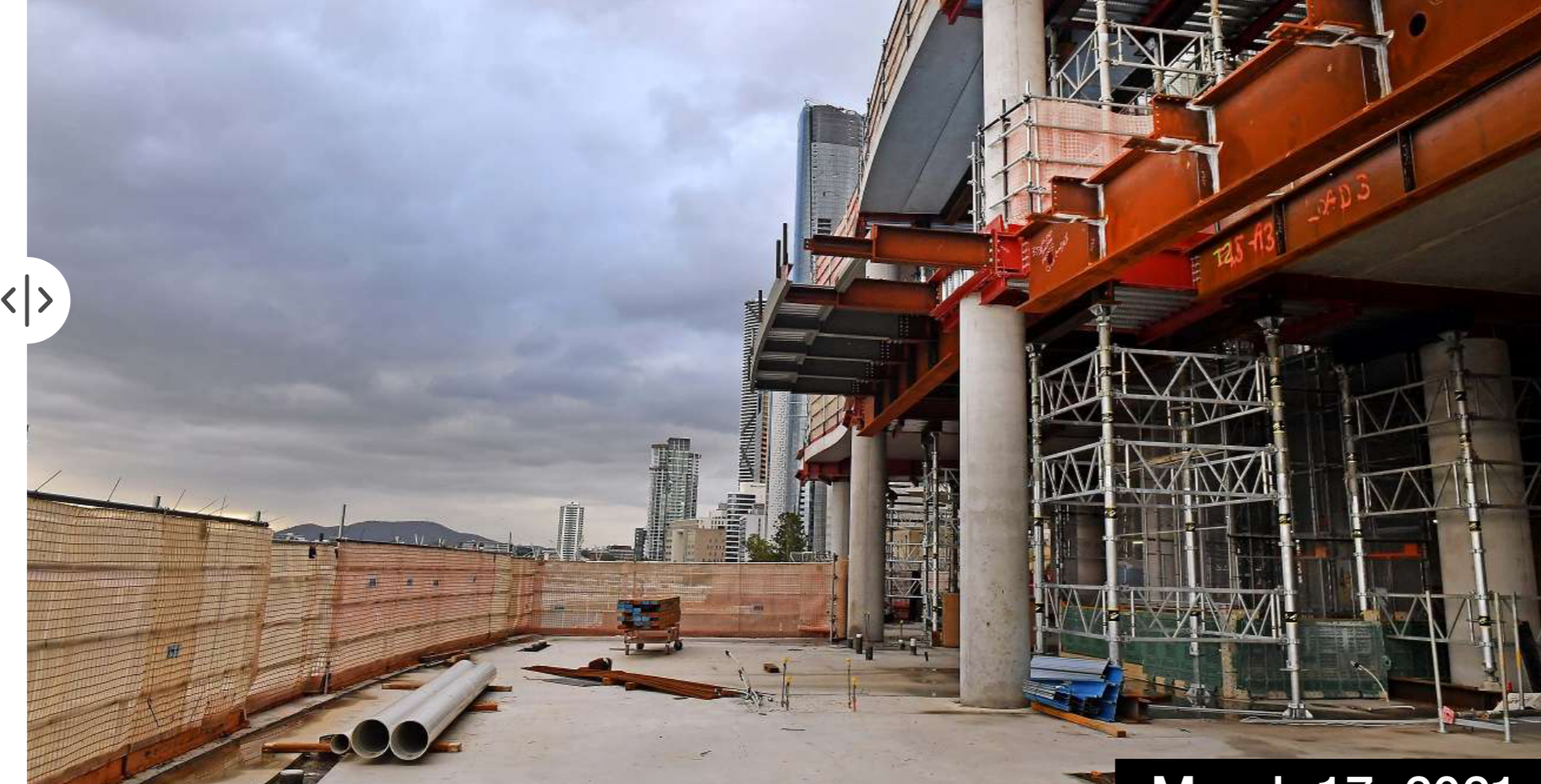
March 17, 2021