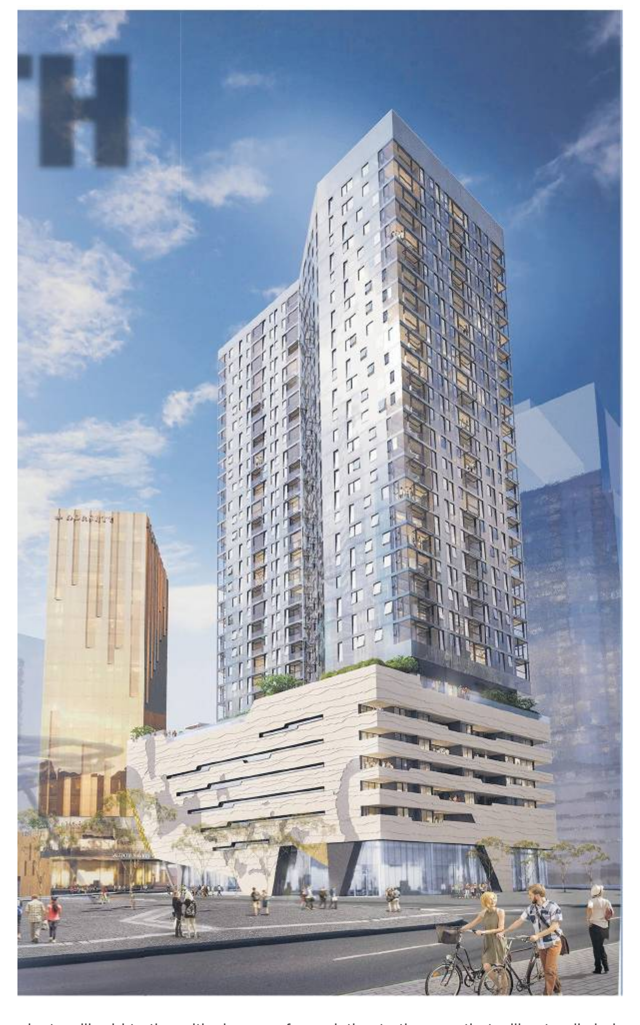
projects will add to the critical mass of population to the area that will naturally help support